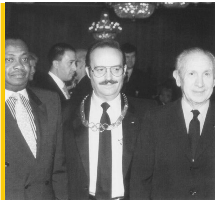
A smiling Mr. Mar Vázquez Raña wearing the Olympic Order in Gold after the presentation made by the IOC President.