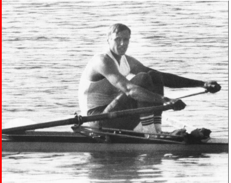
Pertti Karppinen, champion and good sport.

□ The rowing federation of the Philippines has become the 66th member of FISA. Other decisions made at FISA's congress held before the Olympic regatta in Seoul, included confirmation of Montreal as the 1992 venue for the World Junior Championships.