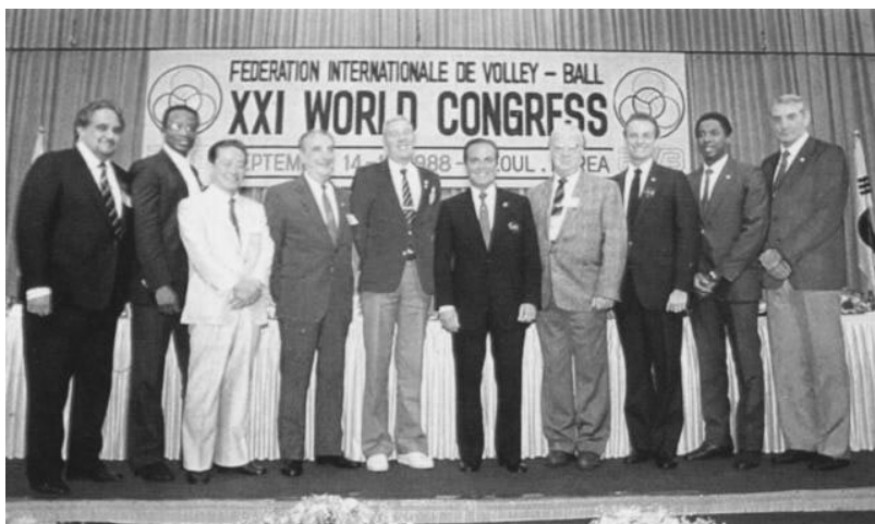
New FIVB board for 1988-1992. Fifth from right, Mr. Rubén Acosta.

Members of the seminar's management group are Messrs. Alex Gilady, Vice-