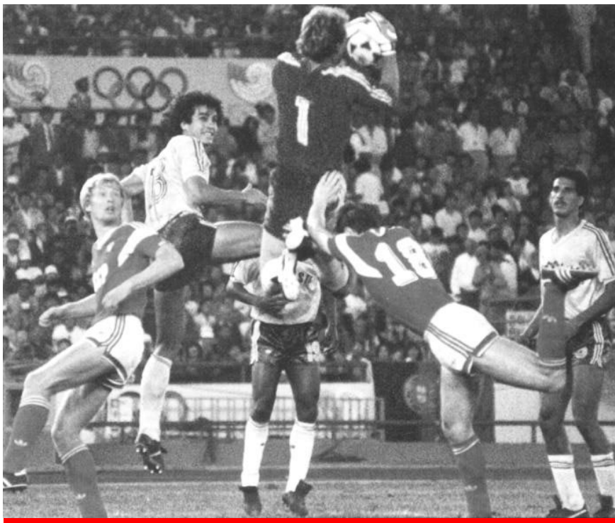
Packed Stadium for the Olympic football tournament in Seoul. URS v. BRA final.

Also honoured were the organizers of the Olympic football tournament in Korea last year. This was equally an expression of thanks to the Korean football spectators, who turned out in force in spite of the home team's early elimination and who behaved in an impeccably sporting manner throughout.