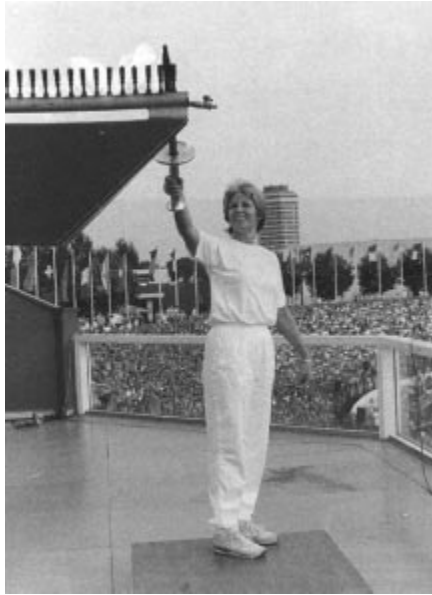
Heide Rosendahl, double gold medallist in athletics at the 1972 Games, lighting the flame at the opening ceremony.

The U.S.A. team, whose last victory in a Universiade tournament was in 1981 in Bucharest, reclaimed the championship with an 88 points to 80 win over the U.S.S.R. The Federal Republic of Germany,