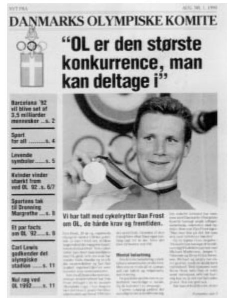
The first issue of the new NOC bulletin.