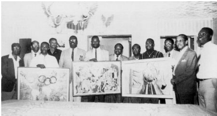
Winning paintings in the Olympic Art Competition organized by the NOC of the Bahamas.