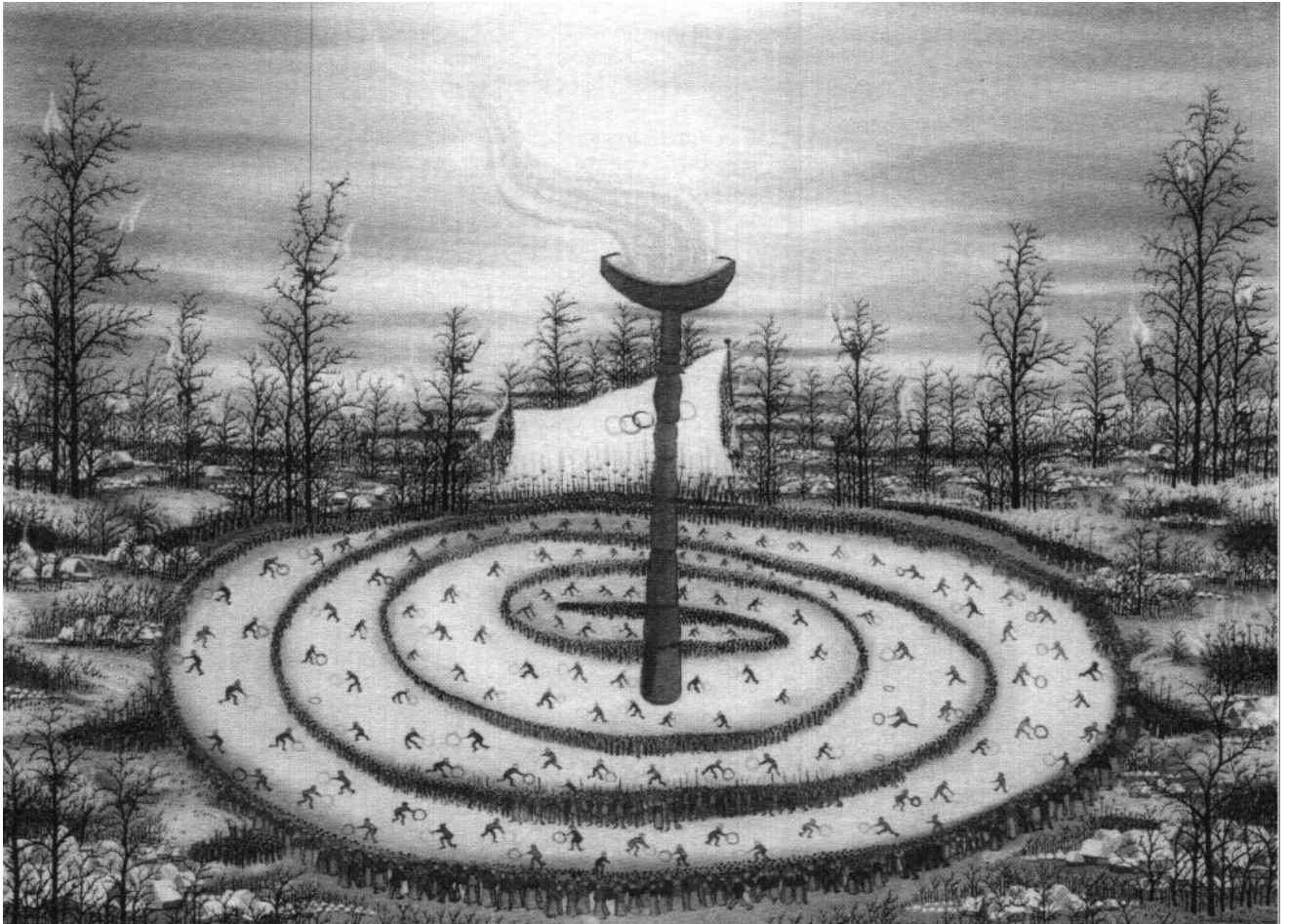
Olympism throughout the world: a painting by Croatian artist Ivan Lackovic.