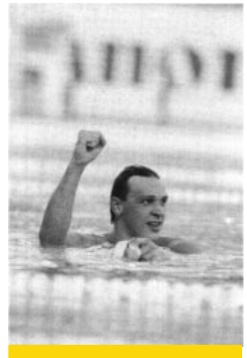
Norbert Rozsa, 1988 Olympic champion, began the series of records by Hungarians. Below, his compatriot Tamas Darnyi did just as well.

Gross, known as "The Albatross" because of his immense wingspan, leaves the sport with three Olympic gold medals and the distinction of having set 10 individual world records during his decade-long career. Gross capped his career with silver medals in both of the butterfly events, a gold in the 4x200m relay and a bronze in the 4x100m medley relay.