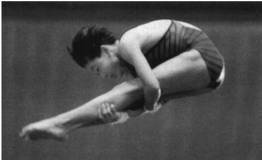
Fu Mingxia, twelve year old champion.

The U.S.A.'s water polo team travelled to Perth and returned with a ticket to Barcelona. By virtue of its fourth-place finish, the United States qualified for the 1992 Olympic tournament. Hungary edged the United States, 13-12, for the bronze medal.