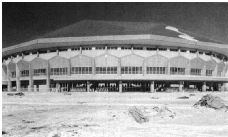
Ice-sport venue for the Winter Universiade.

In a further measure against doping, the IWF board is devising a system which will require all weightlifters who meet the qualifying standards for the Olympic Games to be available for testing five days before the start of competition. Sanctions for a positive test could include life suspension for the athlete and a year's suspension for his federation.