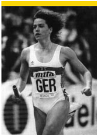
World record breaking German 4 x 400m relay women teams.

competition following his two-year suspension for drug use, was fourth in 6"61. Greg Foster (USA) won the men's 60m hurdles and world record-holder Ludmila Narozhilenko (URS) the women's,