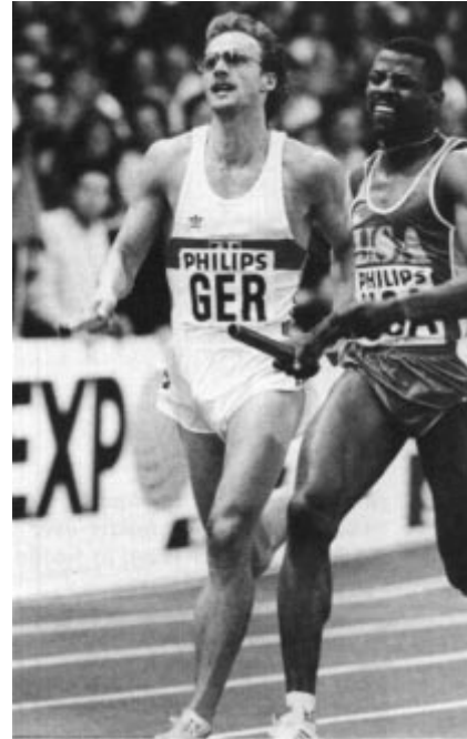
World record-breaking German 4 X 400 relay men teams.