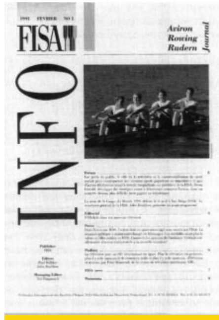
New-style FISA bulletin.