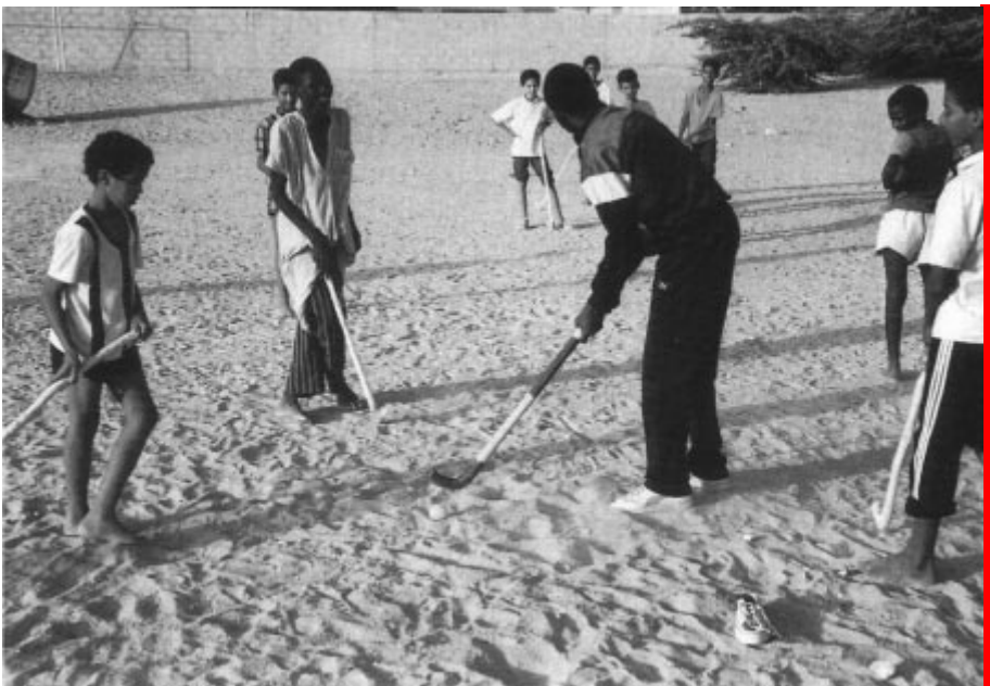
The promotion of sport has a great potential for development.

This being so, this educational concept as outlined here can become a powerful factor for regional valorization. In harmony as it is with the educational principles of large strata of the population because it belongs to Western African culture, to the preservation of which it can make a strong contribution, it carries the essential elements of physical education and sports curricula. Nor is it incompatible with the demands of the majority of the population. By virtue of its freedom from formalism and cumbersome materials, its institutional autonomy, its ecological interest and its cheapness to implement, it can help to improve the social situation of the ECOWAS countries with large rural populations by fostering grassroots participation, action and decision-making and creating a link between the traditional space and the technical world as a step along the road to development. M.H.