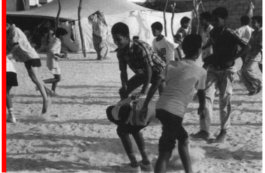
Exercises requiring little equipment.

intangible elements of informal elementary and family-based education. For this reason, the CMYS/ECOWAS wishes to extend this picture of games and movement culture to supra-regional level in order to establish an intercultural symbiosis throughout West Africa. This is an objective of definite political interest, already being looked into by means of studies which are, however, limited owing to insufficient resources.