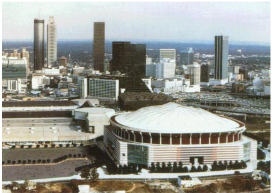
The Georgia Dome in Atlanta, one of the venues for the Centennial Games.