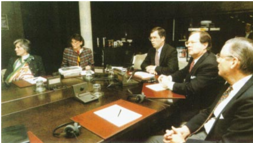
The ACOG delegation presents its report to the Executive Board

hosting just the archery and cycling events. The final of the football tournament is planned for Athens, 113 km north east of the Olympic city, in the 85,000-seat stadium of the local university of Sanford.