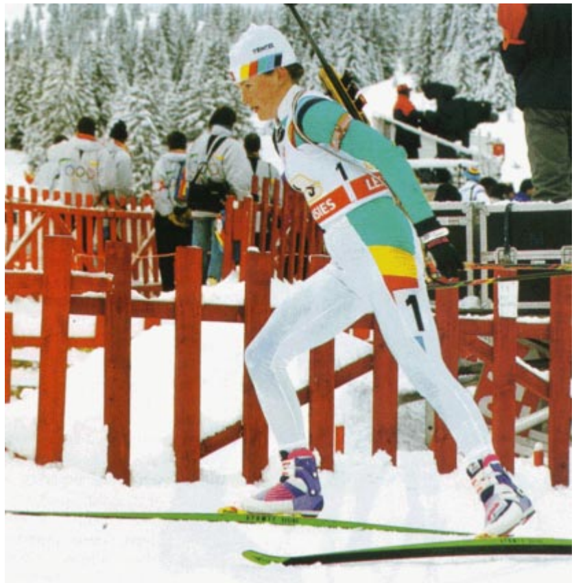
Images of athletes - and women.

Seen through this exhibition, much of what has happened over the course of the century may seem strange, or provoke a smile, as if it were something from another planet. But at the time it was serious! The photos and press cuttings are pieces of evidence that deserve to be studied, particularly by young boys and girls. Mentalities have evolved considerably, men's mentalities as well as women's. But an exhibition like this still makes its point, since the old reflexes have not completely disappeared, and reappear regularly with astonishing ferocity.