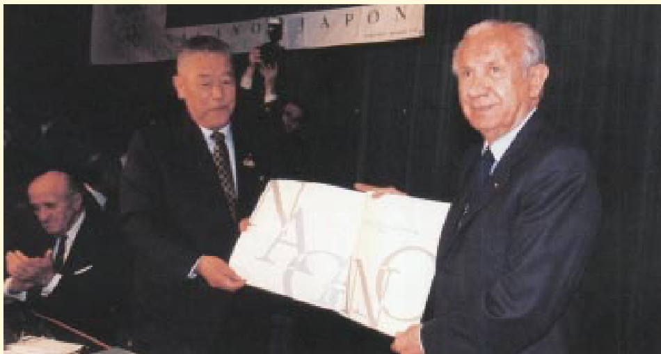
The IOC President handing the official invitation to the president of the Japanese NOC, Hironoshin Furuhashi.