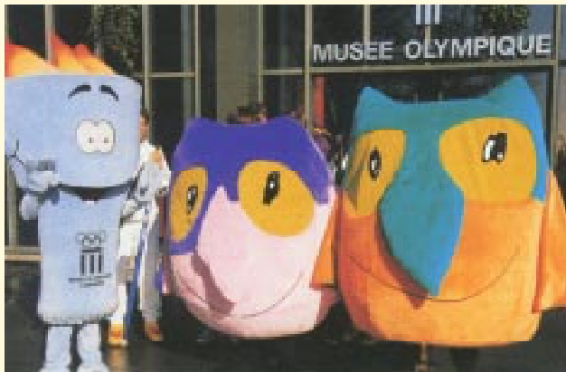
Pyrros, the Olympic Museum mascot, and two of the Nagano "Snowlets".