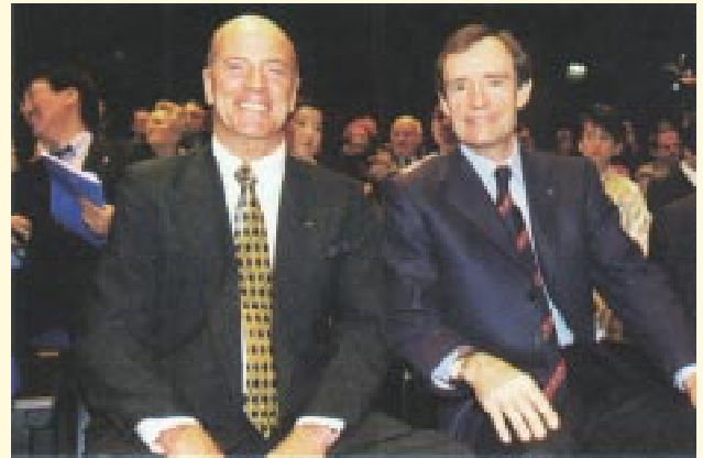
Kevan Gosper and Jean-Claude Killy.