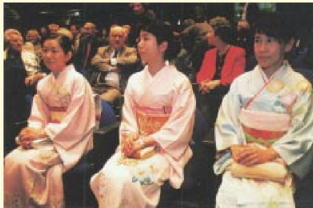
The Japanese hostesses.