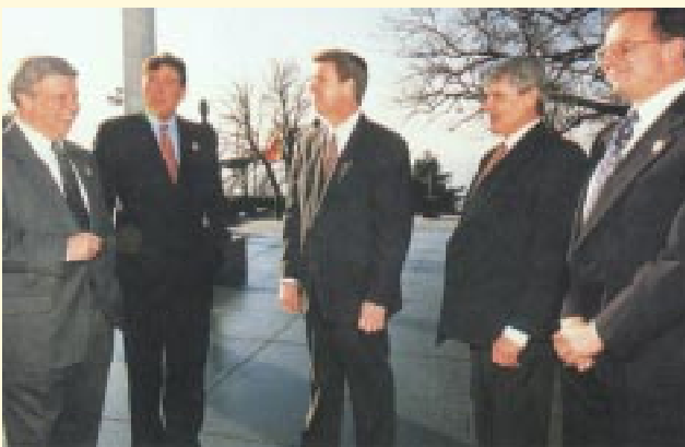
The UPS delegation.