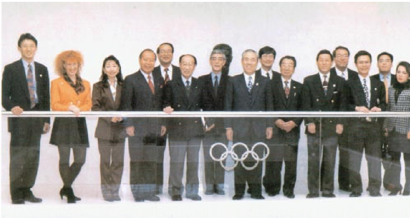
The NAOC delegation.