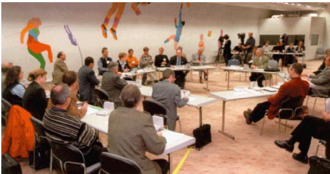
Round table discussion on doping at the AOS.

The AOS's anti-doping technical commission was tasked with drawing up a list of measures. International cooperation will be vital in finding a solution for the third and fourth areas in particular.