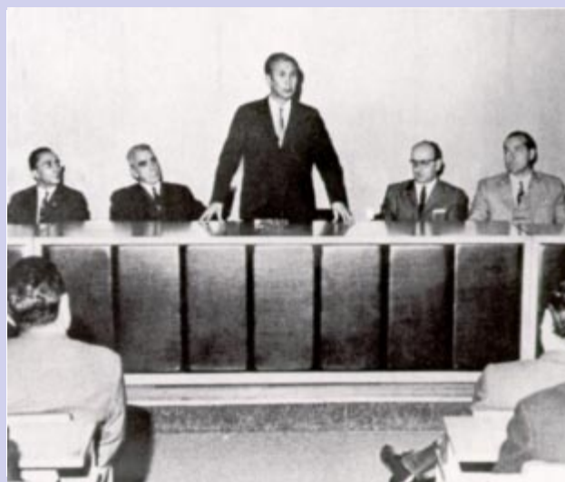
The official ceremony creating the Spanish Olympic Academy. The IOC President (centre) was then the president of the Spanish Olympic Committee.

founder of the Greek Academy in 387 BC, and the symbol of the AOE. The commemorative stamp was presented on 9 December last at an official ceremony at the Post and Telecommunications building in Madrid, which also marked the opening of an exhibition of Olympic and sports philately.