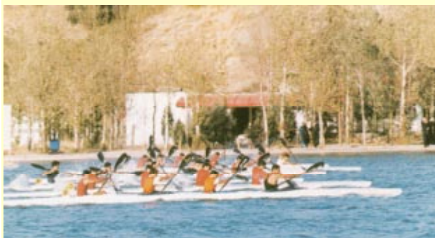
Canoeists from Tadjikistan in training.

This enabled three young athletes and their coach to make use of all the infrastructures made available to them by the Iranian federation.