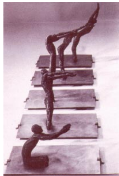
"Off the Blocks" by Lori Norwood (American pentathlete).