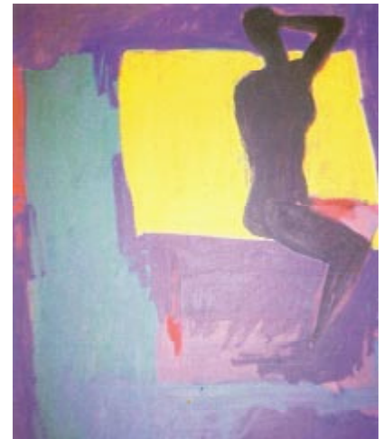
"Untitled" by Jean-Blaise Evequoz (Swiss fencer).