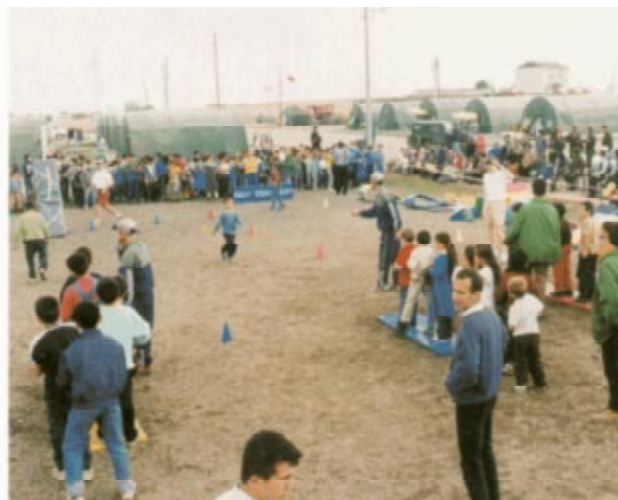
Rediscovering the pleasure of playing thanks to the 'Free of Charge Sport School' programme.