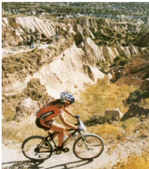
The first race of mountain biking in the Cappadocia national park

provinces of the earthquake area. As of July 2000, 1,500 children had participated in this programme which will continue in the coming months and will reach the rest of the children in the earthquake-hit area.