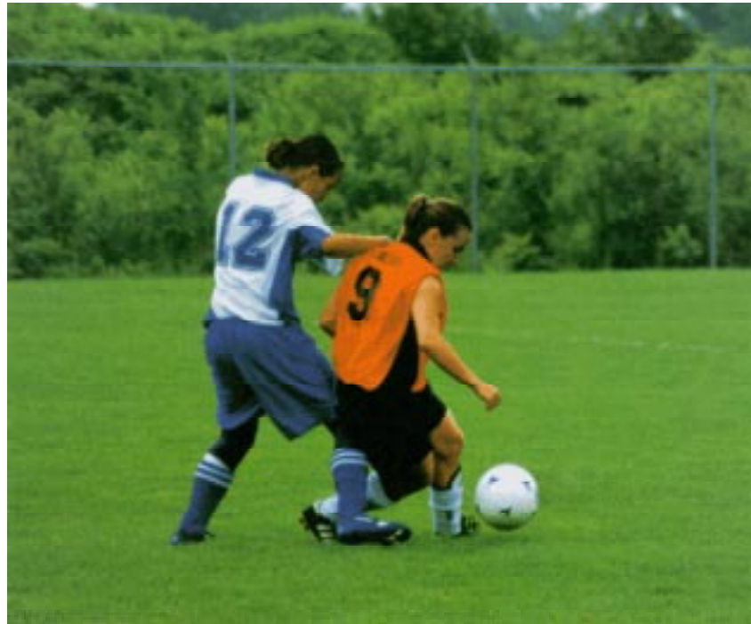
Young female footballers in action.

* President, Committee of the International Children's Games