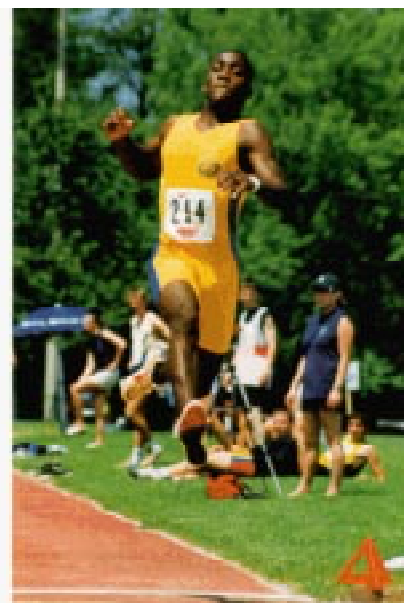
...and the long jump, on the programme of the Children's Games.