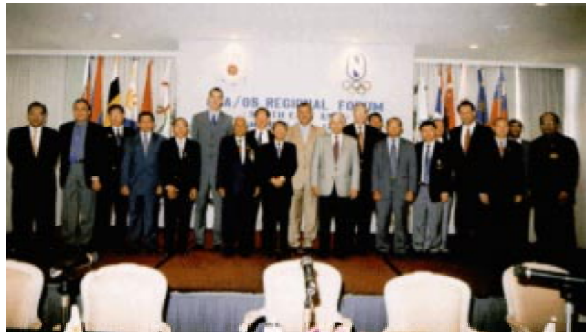
Participants at the Regional forum in Cambodia.