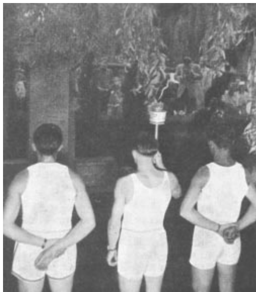
La flamme olympique, de passage à Lausanne, devant la tombe du baron P. de Coubertin, rénovateur des Jeux.