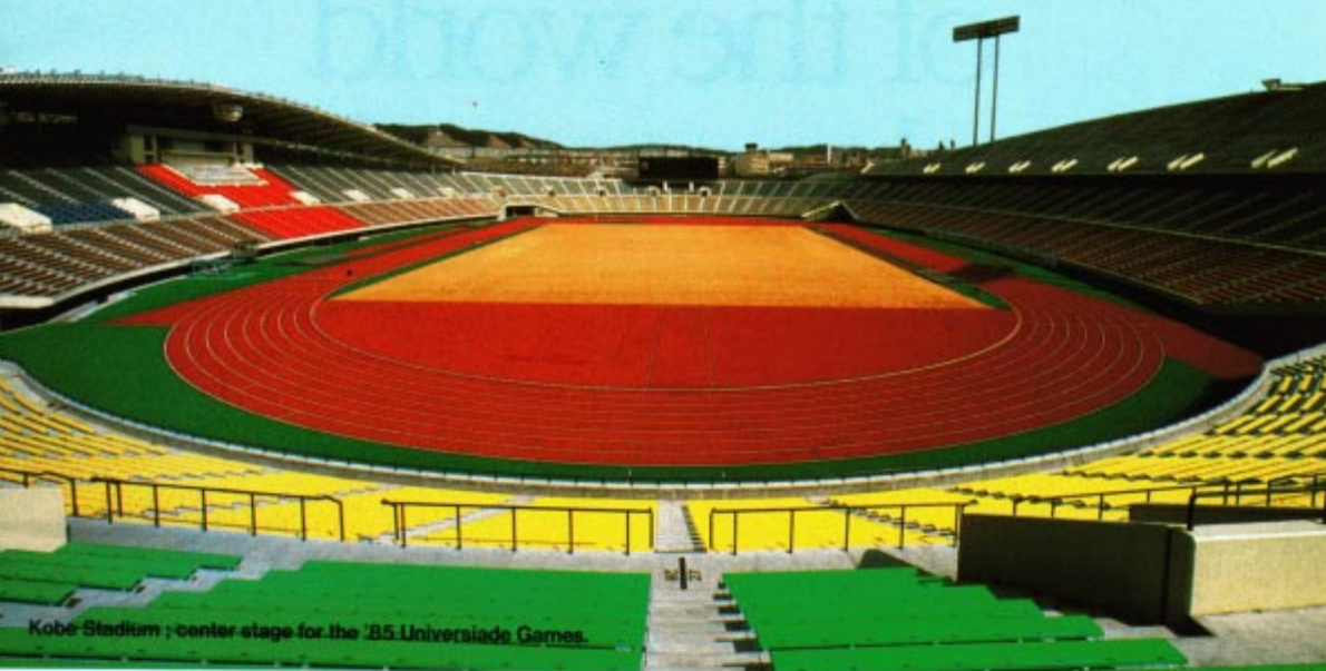
Kobe Stadium ; center stage for the '85 Universiade Games.

The main stadium will be in the spotlight, and Mizuno will be in the wings, supporting the finest athletes and officials of this on going drama of speed and skill with the finest equipment.