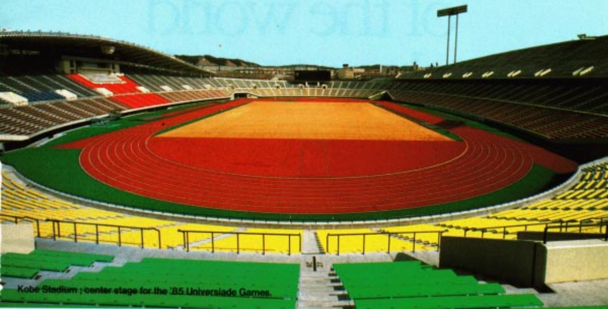
Kobe Stadium ; center stage for the '85 Universiade Games.

The main stadium will be in the spotlight, and Mizuno will be in the wings, supporting the finest athletes and officials of this on going drama of speed and skill with the finest equipment.