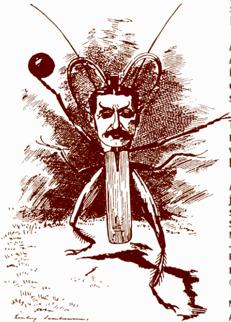
F. R. SPOFFORTH, "THE DEMON" OR IMPETUOUS BOWLER, REPRESENTING CRICKET ON T'OTHER SIDE OF THE H-EARTH.