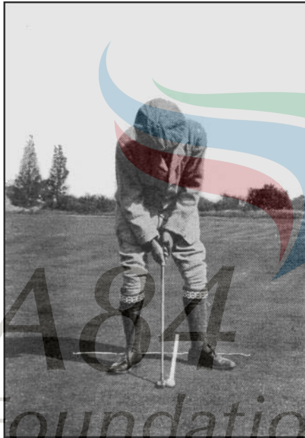
Mr. Walter J. Travis—Stance and address for putting.