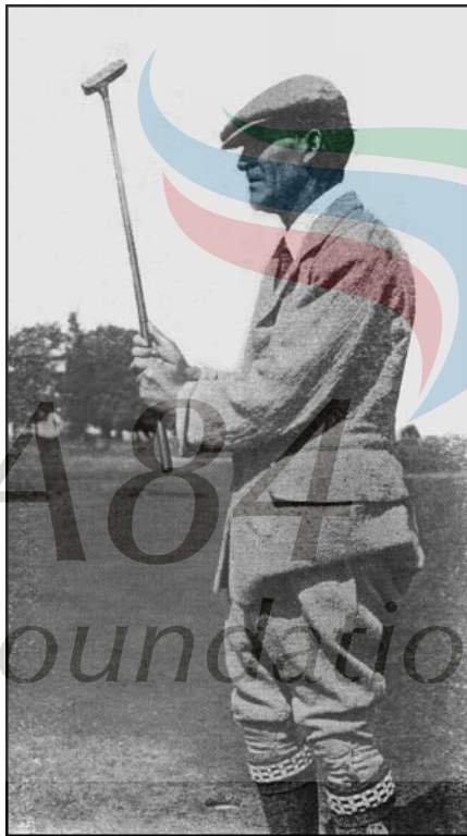
Mr. Walter J. Travis—Showing his putting grip.

this can best be brought about by doing the same thing in the same way every time. In other words, after a certain method has been found which promises the best results, for one's individual needs, that is the one to stick to, but before settling down to any particular style it would be well to conduct a series of experiments in all the moods and