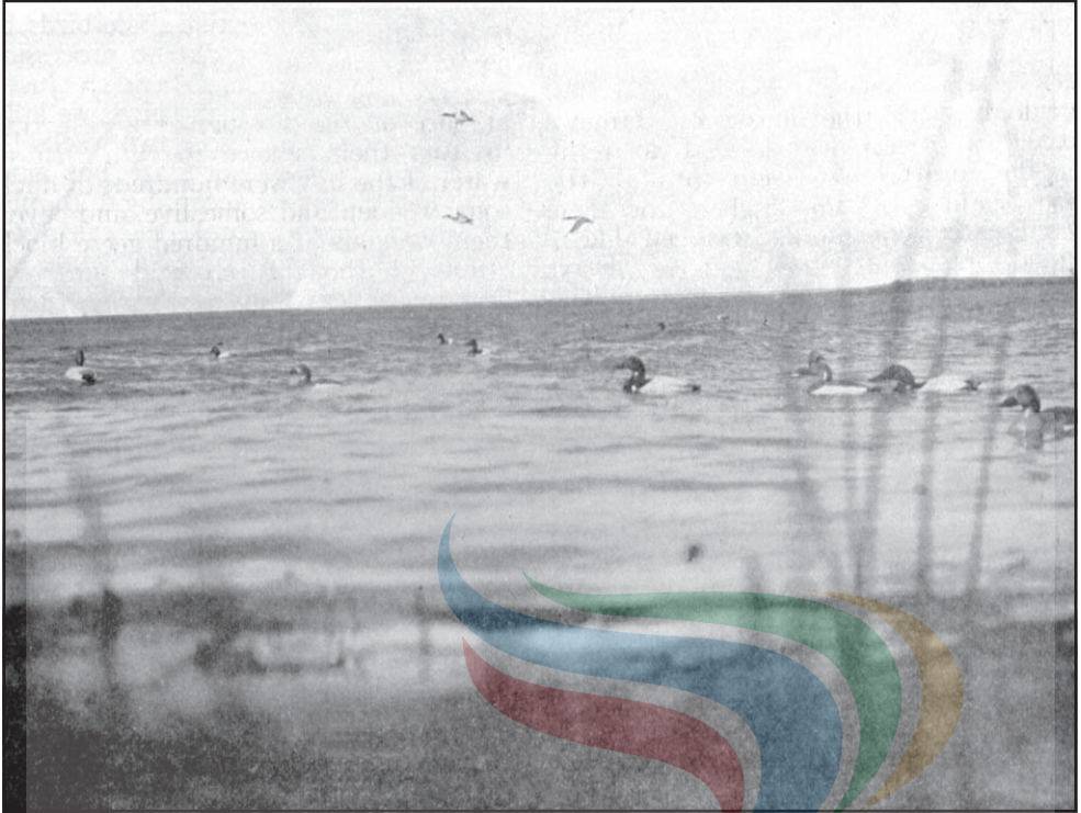
IN THE BAY WERE THE DECOYS

grasped this cord, sho-sho-ed the geese to the front, and with a cry much the same as a goose call, pulled the string. The gate opened, the geese rushed up the incline, and shot up into the air. Straight they went for a full hundred yards, then circled wide over the bay, swung in and lit on the shore directly in front of us. The wild birds had ceased their flight when our decoys went up, and now they circled, came in toward us, and dropped on the water several gunshots out. Our birds on the shore honked and honked, and the wild fowl swam nearer and nearer. By this time my hands were shaking so that I could hardly hold my gun, and my knees were knocking together. I had heard of "buck fever" and scoffed at it, but now I had a very bad attack of it myself. I looked over at Jack—his face was pale, his mouth shut tight and his gun, too, was shaking. I felt that he, as well as myself, was a fever victim. As he had been a hunter previously, the thought rather cheered me up.