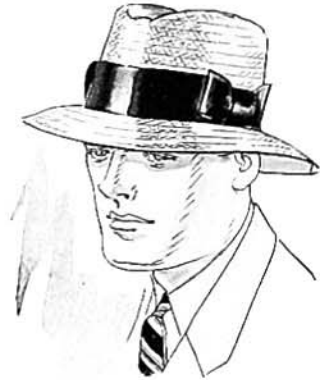
Knox are showing a great variety of hats in both coarse and fine straw. This one is called a "Punta straw," the top part of the Italian grass only being used in its manufacture.

Tripler appears to have secured an Ideal fabric for this "Curzon Model" polo coat—it is woven from the fine silky undercoat of the Kashmir Goat (Habitat India) and is unequalled for softness and warmth. It also has a thermostatic quality—cool at Palm Beach and warm in Alaska—altogether no better coat can be had for Southern wear.