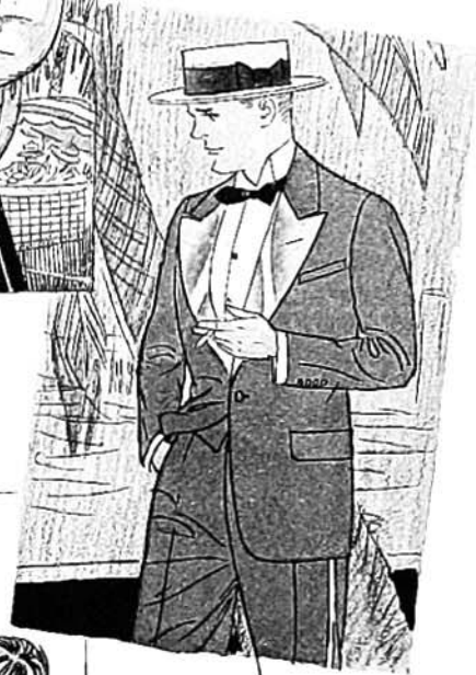
Tripler suggests to us that as dinner clothes are now "de rigueur" at resort hotels and at sea, an extra dinner jacket in a different model helps to break up the monotony of a man's appearance, so here we show a good looking single breasted garment in tropical worsted.