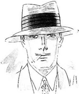
Milan, Leghorn and Panama hats will be popular at the Southern resorts, worn in conservative shapes with quiet hat bands. Above a Milan from Knox.

Tripler appears to have secured an Ideal fabric for this "Curzon Model" polo coat—it is woven from the fine silky undercoat of the Kashmir Goat (Habitat India) and is unequalled for softness and warmth. It also has a thermostatic quality—cool at Palm Beach and warm in Alaska—altogether no better coat can be had for Southern wear.