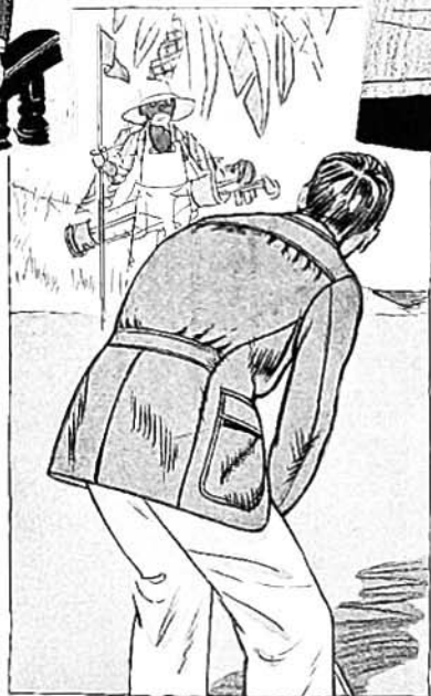
The practical, cool, and comfortable gabardine coat will again be a favorite this coming season. Tripler recommends it in a reddish brown to be worn with white trousers and cocoa brown buckskin shoes.