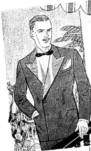
Very smart indeed is this double breasted blue dinner Jacket featuring a faint herringbone in unfinished dress worsted (tropical weight). The fact that the Prince of Wales possesses a similar garment will probably not prevent New Yorkers from taking kindly to it. F. R. Tripler & Co.