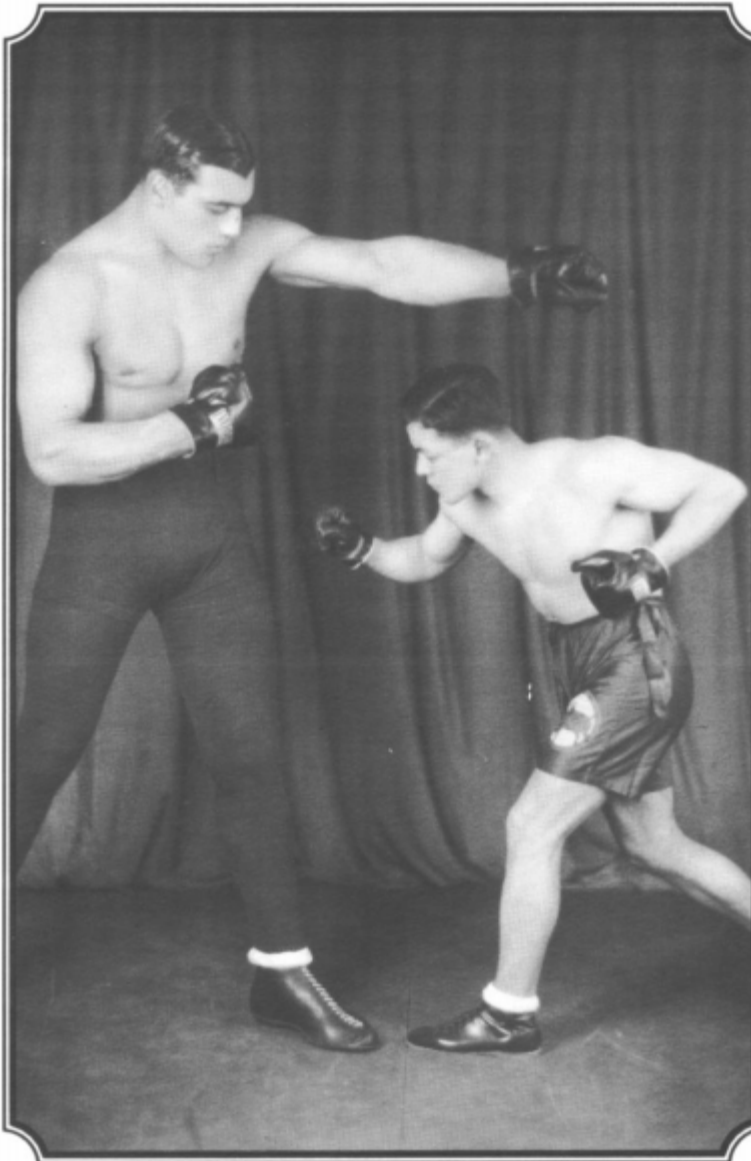
This wonderful photo of the young Primo Camera gives some sense of his phenomenal natural size. Camera lifted weights a bit as a young man and several sportswriters blamed his relative ineptitude in the boxing ring on his lifting, ignoring the fact that he had very little serious training in boxing before his promoters thrust him into bouts with much more experienced men. Even so, he won most of his matches and, for a brief time, was world heavyweight champion.

Of course, not everyone agrees with Black's assessment. Some coaches still privately admit to lingering skepticism about weight