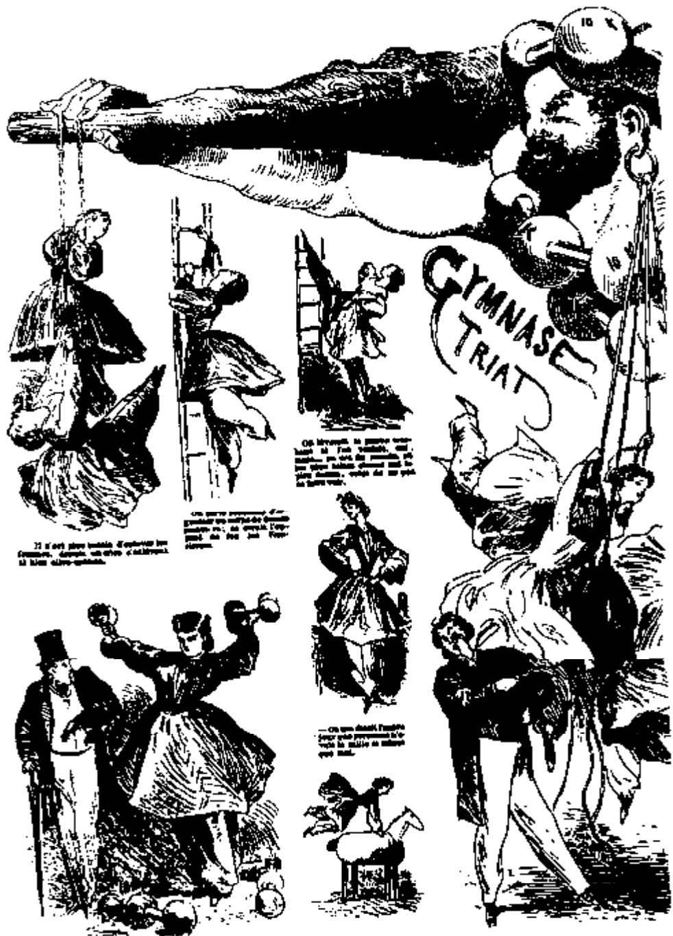
A SATIRICAL CARTOON FROM THE FRENCH MAGAZINE LA VIE PARISIENNE 1863 POKES FUN AT THE TWO DANDIES WHO HAVE COME TO SEE THE WOMEN TRAIN AT TRIAT'S GYM. TRIAT WAS A PIONEER IN WOMEN'S PHYSICAL EDUCATION AND ENCOURAGED WOMEN TO PARTICIPATE IN VIGOROUS, STRENGTH-PRODUCING EXERCISES.

Each exercise leads to the next with fiery rapidity: large and small dumbbells, the gladiator's dance, running in long lines that double back on themselves like the coils of a serpent, the short bar, fighting with the bar, club swinging, and finally the heavy barbell. Every movement in this series is done with an energy which seems almost magical. Many of the participants are overcome by fatigue, but they do not even have the time to wipe the sweat which drenches them. A magnetic current seems to run from the teacher to each student. The power of the master separates them and causes them to pour out the last drop of energy. Every student hears a mysterious voice within