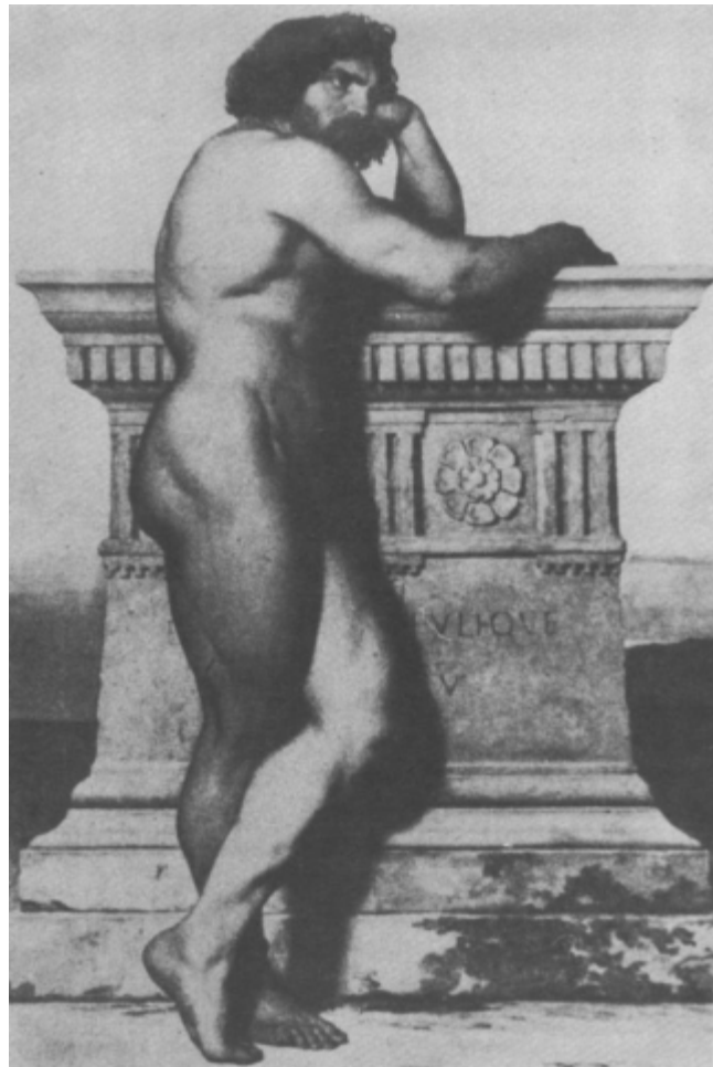
HIPPOLYTE TRIAT'S BODY, SHOWN TO PERFECTION IN THIS EARLY PHOTOGRAPH, COMBINED POWER, SYMMETRY AND MASSIVE MUSCULARITY.

In order to understand Triat and his achievements, it is