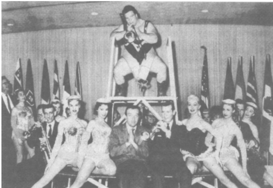
During Anderson's years as a professional strongman he often did hiplifting as part of his act. Here, at the Mapes Hotel in Reno, he lifts members of the chorus and band while playing a trombone.

Whatever Paul was attempting to hiplift on the occasion of his injury (and a discussion of that amount will have to wait for another time), he maintained that it caused an injury to his right leg. He recalled that the weight-situated on the earth beneath a platform five feet high—had become frozen to the ground later that evening, after he had lifted it on several occasions earlier in the afternoon. 9 The chronology, as well as the circumstances causing the injury, present problems.