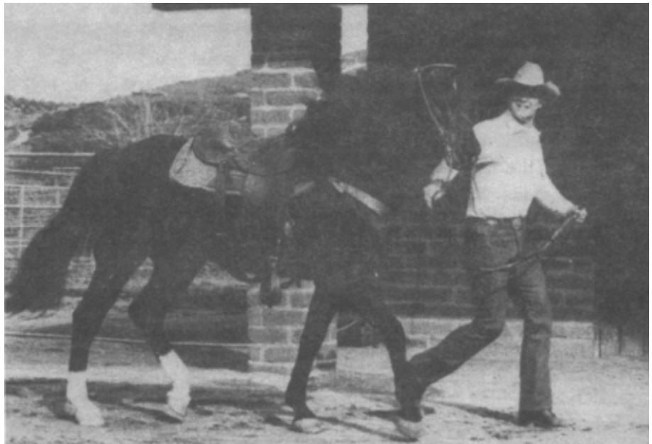
Steve Reeves was a horseman all his life, and those who knew him best say he was never happier than when he was training one of his beloved Morgan stallions, or riding in the high country of the Palomar Mountains near his ranch.