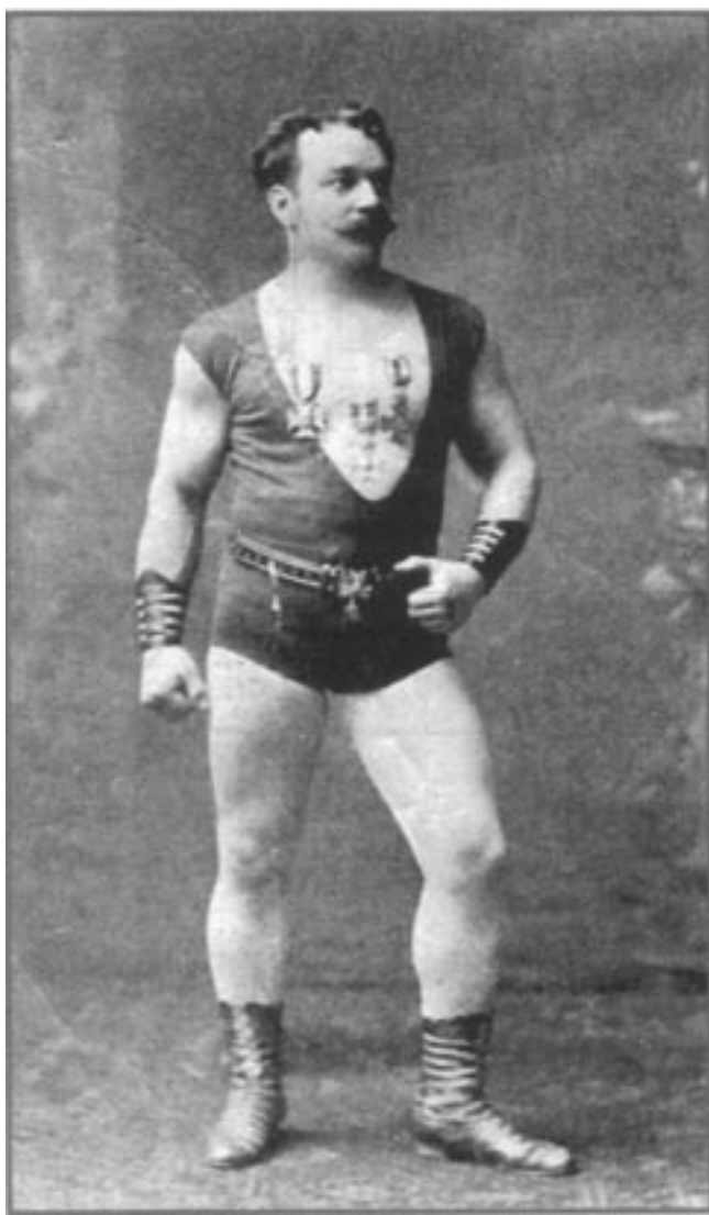
In his prime, Attila stood 5'4" tall, weighed 175 pounds and had the following measurements: chest - 46", neck - 17.5", calf - 16.5", waist 36", and thigh 25". This photograph was taken in approximately 1894.

Attila’s leg exercises began with calf raises and a similar exercise for the front of the lower leg in which