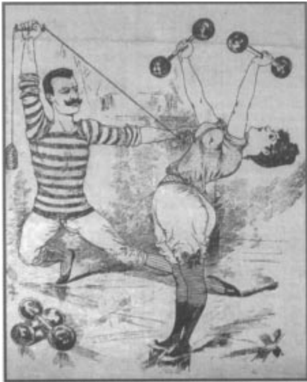
Undated French cartoon from the Attila scrapbook showing Attila working with a woman trainee.