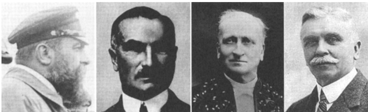
Four competitors in the Paris-Toulouse-Paris race. From left to right: René de Knyff, Selwyn Edge, Louis Renault (winner of the voiturette class) and baron Adrien de Turckheim.

drove from Vincennes to Montgeron, where they departed for the timed part of the race at 3:07 in the morning, with two-minute intervals between the contestants. Along the course, 82 control posts were placed, which all cars had to pass. After the race, the vehicles were exhibited at the Exposition in