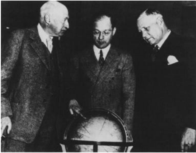
Three leaders of the International Olympic Committee in 1936 (From left to right): Henri de Baillet-Latour, Avery Brundage, and Sigfrid Edstrom.