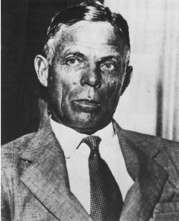
William E. Dodd, American Ambassador to Berlin during the Hitler years.

accorded to them by the German authorities and would not suffer any inconvenience.