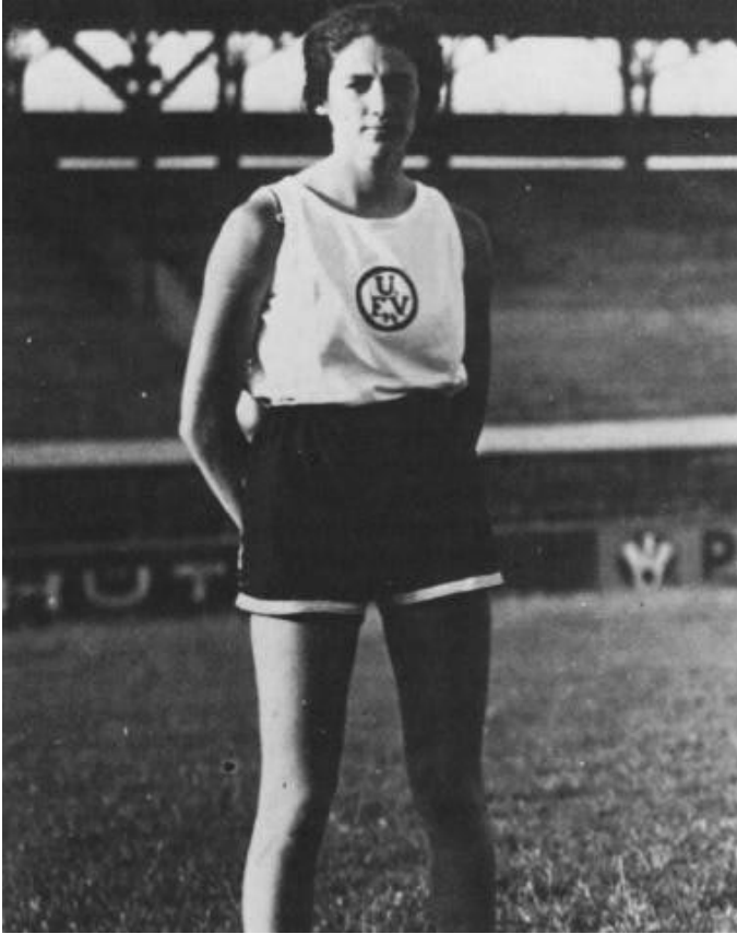
Gretel Bergmann. She was excluded from the German Team because of her Jewishness.

neither the foreign press nor the American embassy had an inkling. Bergmann happened to share a room in the training camp with Dora Ratjen, who later became the second choice for the Olympic team. At the time, the Jewish jumper conveyed her impression to some of her close associates that “this girl was a boy.” Her suspicion was not investigated then, but two years later Ratjen was barred from women’s sport when it was found that she was a man. The final solution to this puzzle fell into place only thirty years later when Dora Ratjen herself admitted to being planted on the team, probably to stop Bergmann from qualifying for the German team. 37