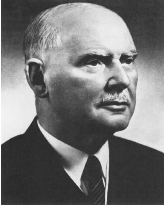
Theodor von Lewald. The controversial head of the German Olympic Organizing Committee.

that this extended not only to preparations for the Olympic Games in Berlin, but also for sport competitions within the country with no reference to the Games. To this Dr. von Lewald could make no answer because he knew that he could not deny to me that this was the situation.