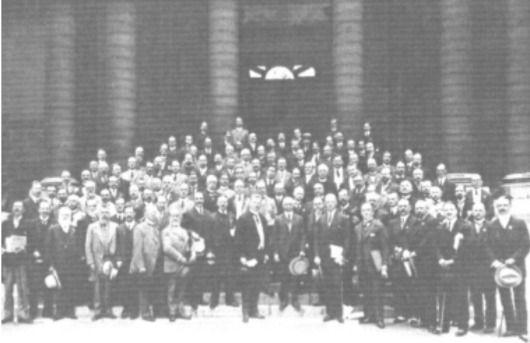
IOC members, International Sports Federation officials, and NOC delegates at the 1914 Congress

uled Berlin Olympic Games of 1916. Because of the Great War, the commission never met. A short and distorted version of the proceedings was published by Coubertin in a special brochure printed in November 1919. 2 Had he published them in Revue Olympique , the difference between fact and fiction would have been more obvious.