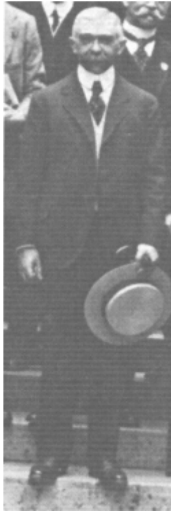
Pierre de Coubertin at the Congress

In convening the Congress, the IOC encountered an unprecedented problem for which the selection of the preparatory commission proved to be utterly unsuitable: The National Olympic Committees (now 32) demanded a voice in the proceedings, and so did the international sports federations (now 10). 5 The preparatory commission had very little to do with problems attendant to the organization and administration of sports, items which were high on the agenda of the National Olympic Committees in terms of team selection and the international sports federations responsible for the rules of international sports and which necessarily had to fit the Olympic Games into established schedules of national and international sporting championships.