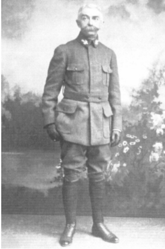
'A Call to Arms'

and that of one's country. This explains why Coubertin did little to quell the nationalism that surrounded the Olympic Games from the very beginning. In fact, Coubertin encouraged it, through symbols and actions.