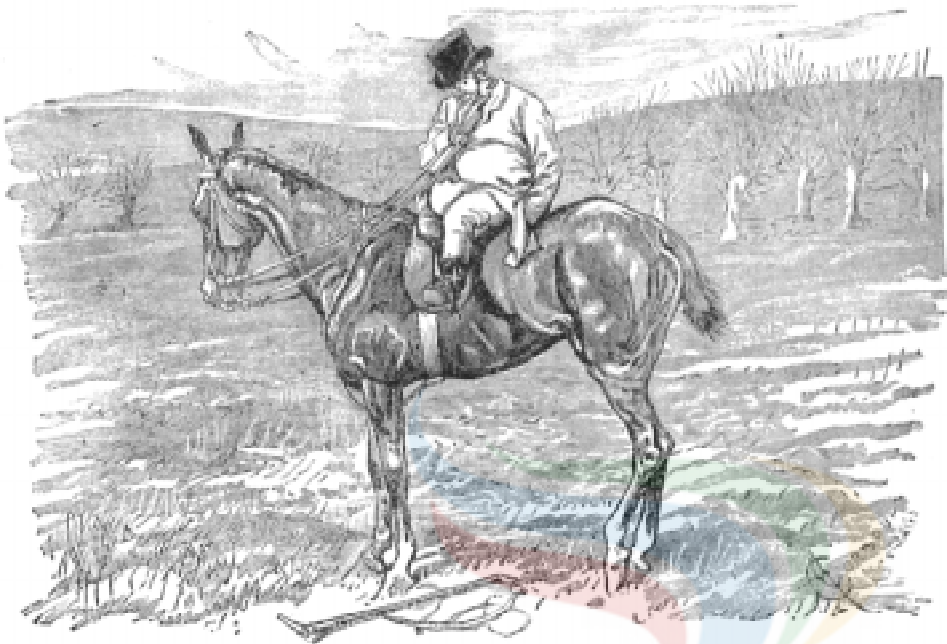
QUESTION NO. 1. "HOW AM I TO GET THAT WHIP?"