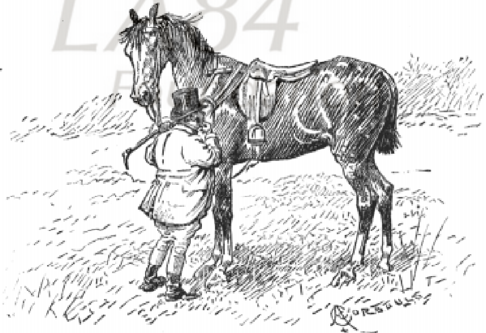
QUESTION NO. 2. "HOW AM I TO REACH THAT SADDLE?"

With OUTING's best compliments to brother Punch .