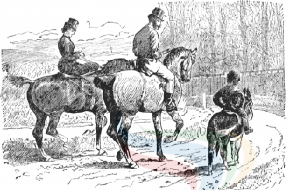
YOUNG HOPEFUL—A CHIP OF THE OLD BLOCK.