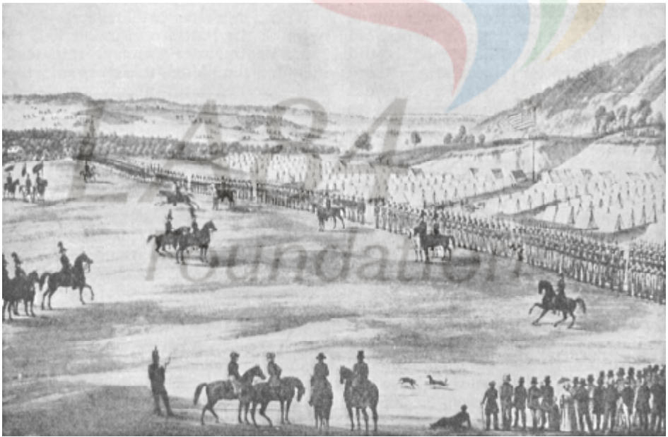
CAMP KOSCIUSKO, 1842.

"Second. That none of the subscribers shall disobey the orders of either of the officers while under arms or in