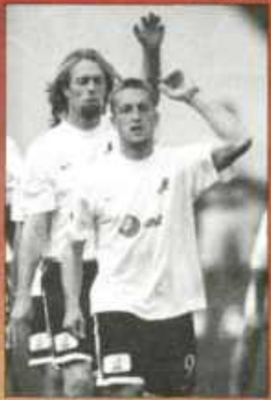
"Who's gonna win? ... Oh man, I know this one!"