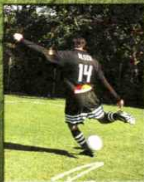
Danielle Fotopoulos U.S. Women's National Team 1999 Women's World Cup Champion