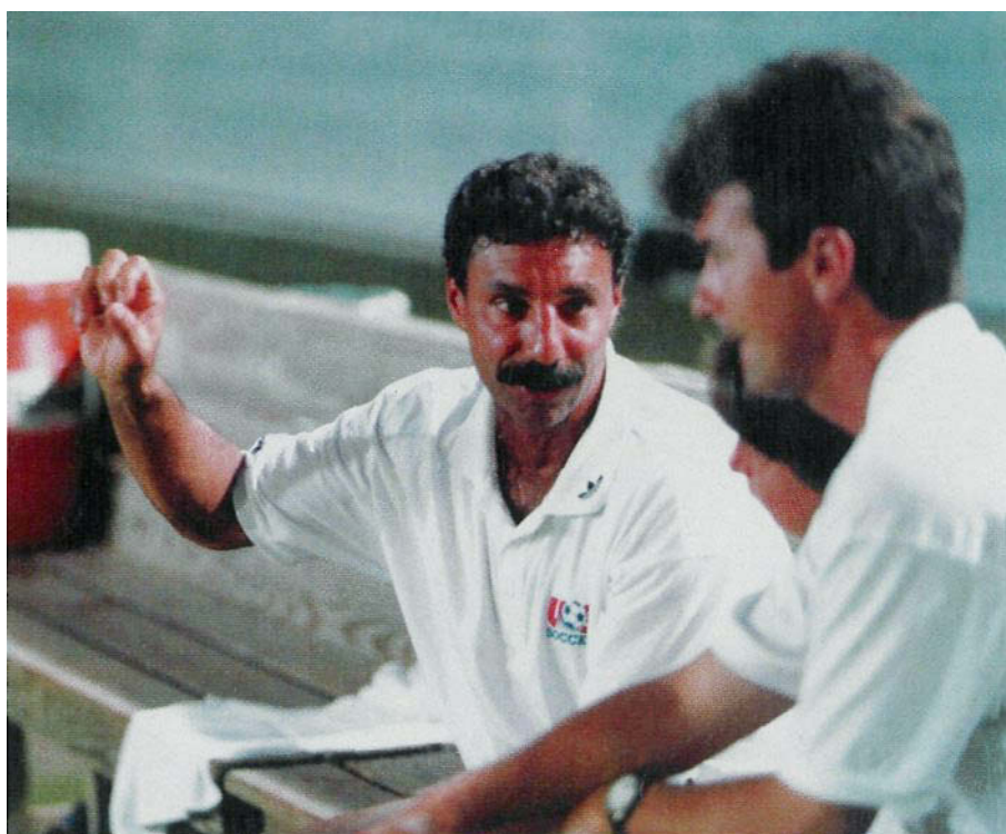
Tony DiCicco (left) and Anson Dorrance have both led the United States to Women's World Cup titles.