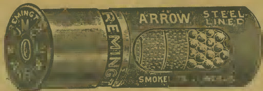
A Safe Choice for Top Scores

Remington Arms-Union Metallic Cartridge Company 299 Broadway : : New York