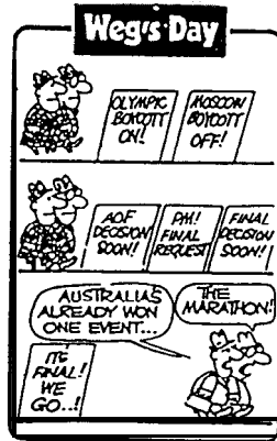
Figure 7: Weg , The Herald, 20/6/80