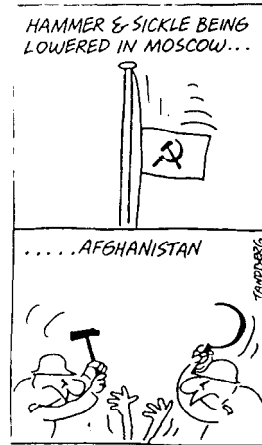
Figure 3: Tandberg, The Age, 25/4/80