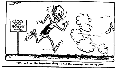
Figure 5: Jeff , The Sun, 15/4/80