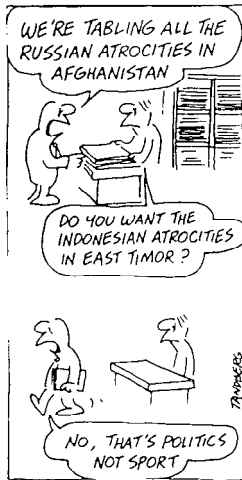
Figure 2: Tandberg, The Age, 18/4/80