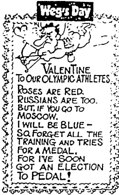
Figure 6: "Weg", The Herald, 14/2/80