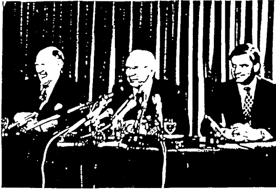
Figure 1: The Age, 24/5/80